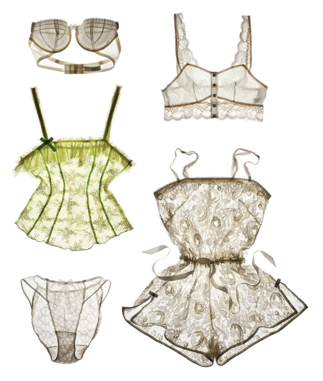
July 30<sup>th</sup> – August 6<sup>th</sup>, 2013 CHELSEA MARKET 75 Ninth Avenue. New York