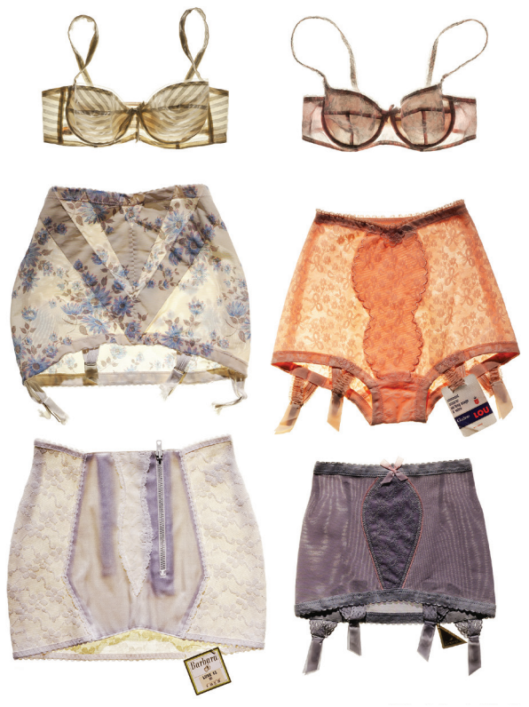
July 30<sup>th</sup> – August 6<sup>th</sup>, 2013 CHELSEA MARKET 75 Ninth Avenue. New York